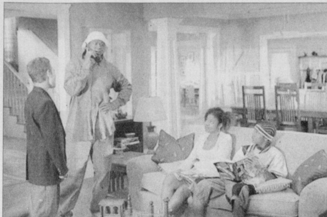
Noel Callahan as Louis (left), Master P as Percy Miller, Erica O'Keith as Jodi and Romeo appear in a scene from Nickelodeon's 'Romeo.'