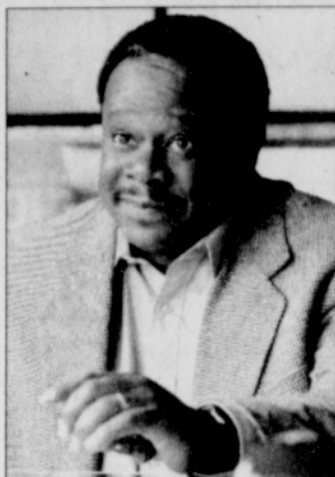
Cedric the Entertainer stars in "Intolerable Cruelty."

"Gus Petch is a little overly serious," says Cedric about his character. "He is a little ex-military - more merchant marine or probably a general in the Salvation Army. And he expects people to give him a lot of respect for his job. He was hired by Marilyn Rexroth to gather incrimi-