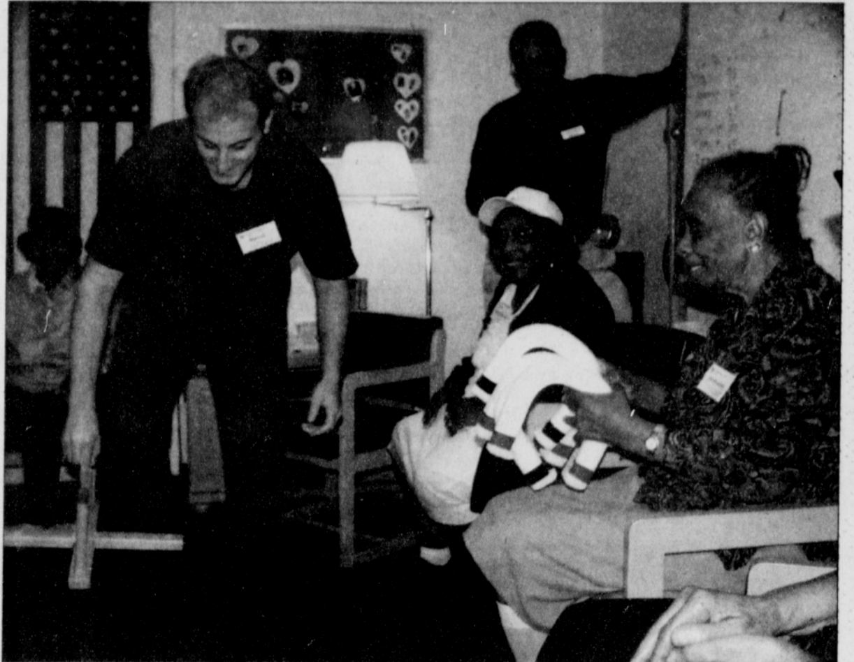
Seniors work their mind and body by participating in a variety of activities at the adult day care program at the Marie Smith Center on North Albina Avenue.

At VOA, adult day care participants come for a variety