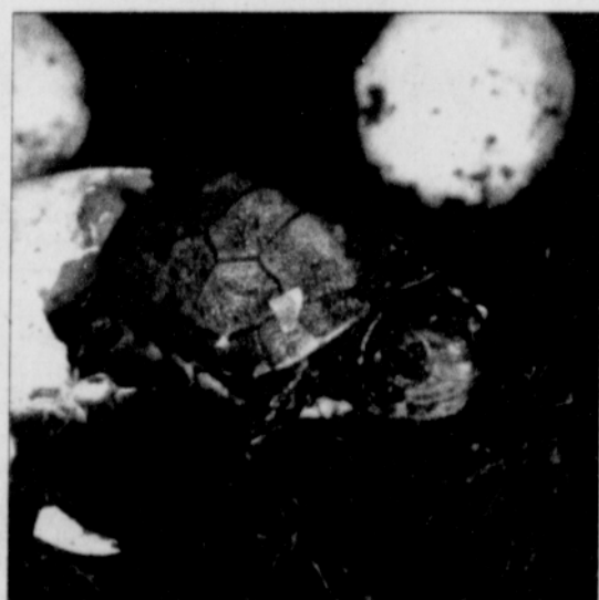
A threatened western pond turtle from the Columbia River Gorge.

Oregon Zoo is a service of Metro. The Zoo is committed to conservation with a number of projects aiding local species.