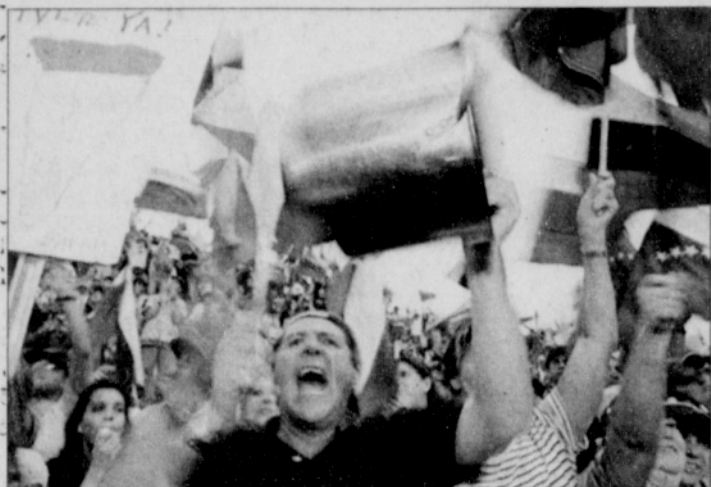
Ear-splitting protests against President Hugo Chavez and his supporters have become so obnoxious that the Venezuela Congress is considering legislation making them punishable by up to five years in prison.

(AP) — Depending on how you do it, banging on pots and pans - a traditional Latin American protest against unpopular governments and tough times - could soon land you in prison in Venezuela.