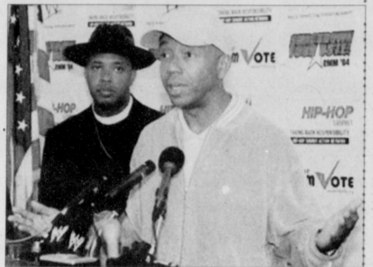
Russell Simmons (right) and Rev. Run of Run DMC announce a voter drive called "Smackdown Your Vote," a partnership of the Hip Hop Summit Action Network and World Wrestling Entertainment.

The groups will register voters at hip-hop concerts and wrestling events around the country, hold rallies at colleges and high schools