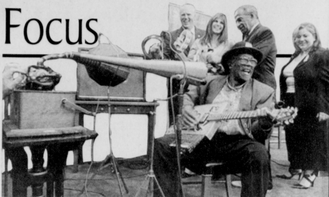
Rhythm and blues entertainer Bo Diddley records on a 125-year-old wax cylinder phonograph on Capitol Hill. His backup band is, left to right, Rep. Joseph Crowley, D-N.Y., Rep. Mary Bono, D-Calif., John Conyers, D-Mich., and Rep. Linda Sanchez, D-Calif.