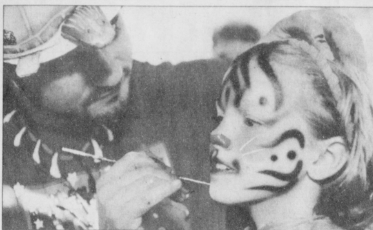
Facepainting is one of the ways kids will learn about cultural traditions at the World Animal Festival at the Oregon Zoo.

The Oregon Zoo's World Animal Festival showcases how animals have been feared, revered and celebrated throughout the world. The event is from 10 a.m. to 4 p.m. Saturday and Sunday, Sept. 20 and 21 and 27 and 28. This year, the