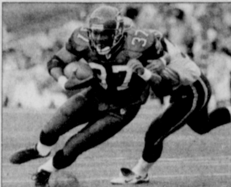
Seattle Seahawks' Shaun Alexander runs to the 3-yard line as St. Louis Rams' Pisa Tinoisamoa hangs on during the fourth quarter in Seattle Sunday. The Seahawks scored the winning touchdown as they went on to win 24-23.

He finished with 58 yards rushing on 14 carries and also caught three passes for 8