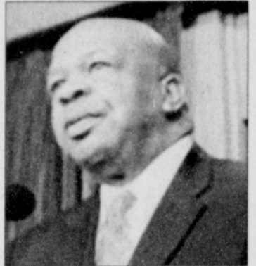
U.S. Rep. Elijah E. Cummings

We must continue to advocate for the rapid evolution of our nation