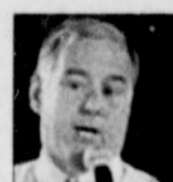
Democratic presidential candidate Howard Dean

The former Vermont governor's four-day, 10-city "Sleepless Summer Tour" came to Oregon three