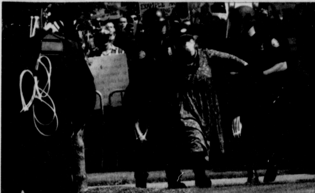
Portland police arrest a protester outside the University of Portland campus Thursday where President Bush was raising $1 million for his re-election campaign.

On that occasion police used tear gas and non-lethal bullets to disperse demonstrators in down-