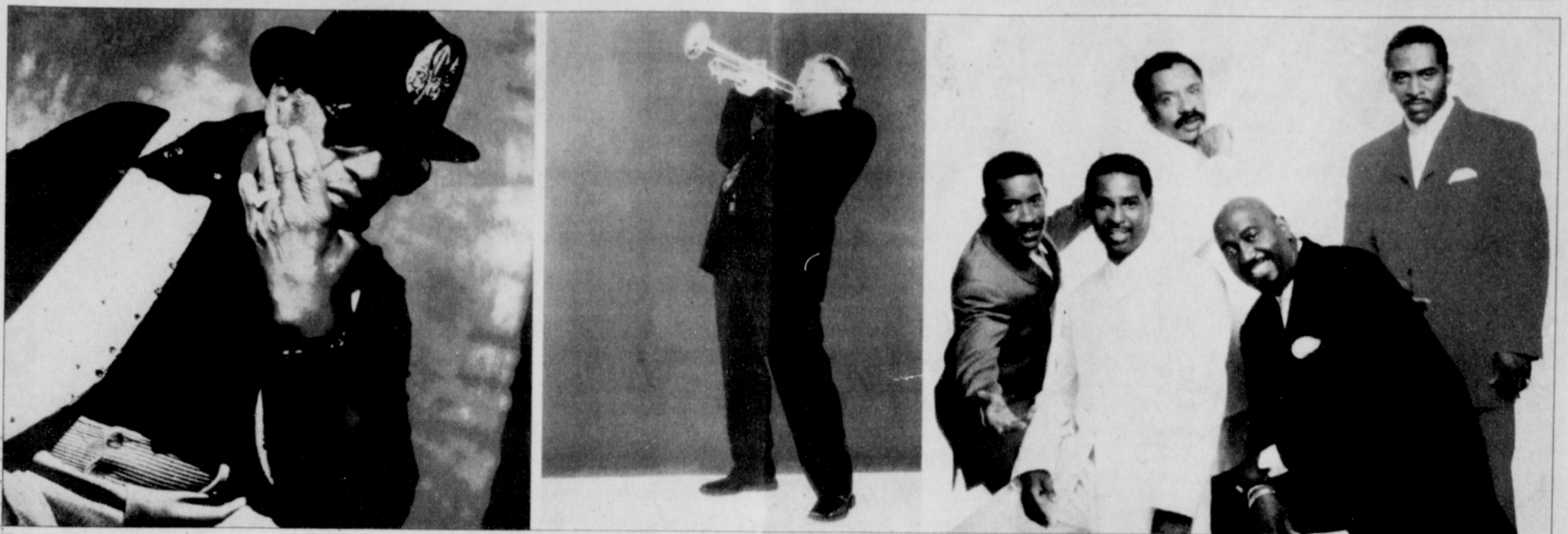
From left, Bo Diddley, Arturo Sandoval and The Temptations are some of the featured artists at the Vancouver Wine & Jazz Festival this weekend.