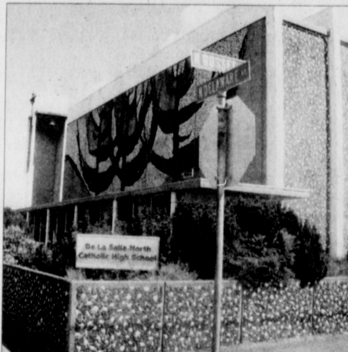
De La Salle North is making construction plans for a larger high school at the former Queen of Peace church at North Delaware and Russett Streets.