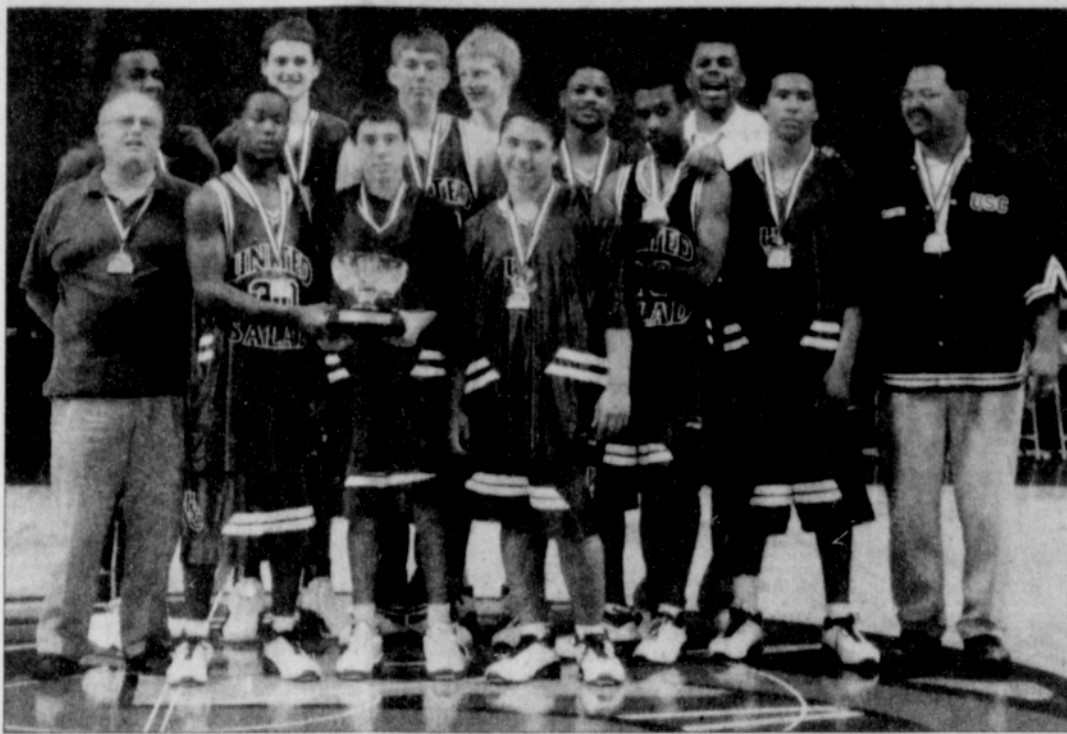
A local AAU basketball team made Portland proud as National Champion runners up.

Multnomah County Sheriff's Office is an equal opportunity employer. Applicants representing the diversity of Multnomah County are invited to apply.