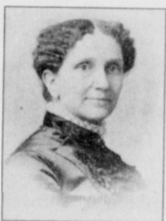
Mary Baker Eddy

The nationally acclaimed touring exhibit, "This is woman's hour..."—The Life of Mary Baker Eddy, will be on display at the North Portland branch of the Multnomah County Library from Friday, Aug. 8 through Sept. 10.