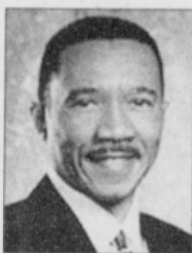
NAACP president Kweisi Mfume

Liberal blacks shunned for carefully chosen minority audiences