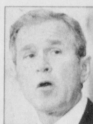
President George W. Bush

While Bush, who got only 9 percent of the black vote in 2000, has shunned sit-downs