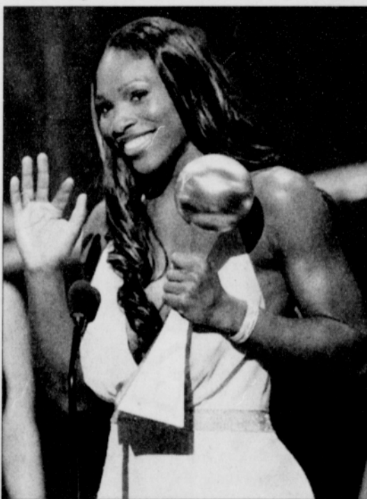
Serena Williams is honored as female athlete of the year at the annual ESPY Awards in Los Angeles.

Duncan, who helped the San Antonio Spurs win a champion-