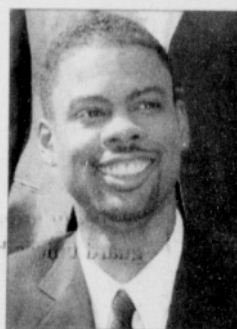
Comedian Chris Rock will host the MTV Video Music Awards Aug. 28 in New York.

(AP)—Chris Rock will be back as host of the MTV Video Music Awards. But he acknowledges that his stand-up skills are a little rusty.