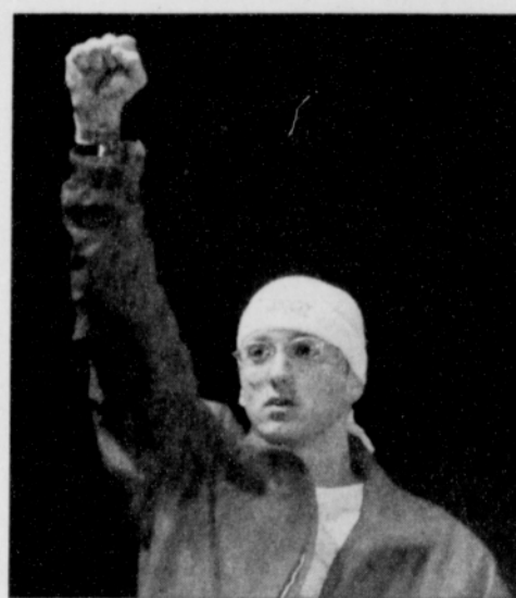
Rapper "Slim Shady" Eminem.