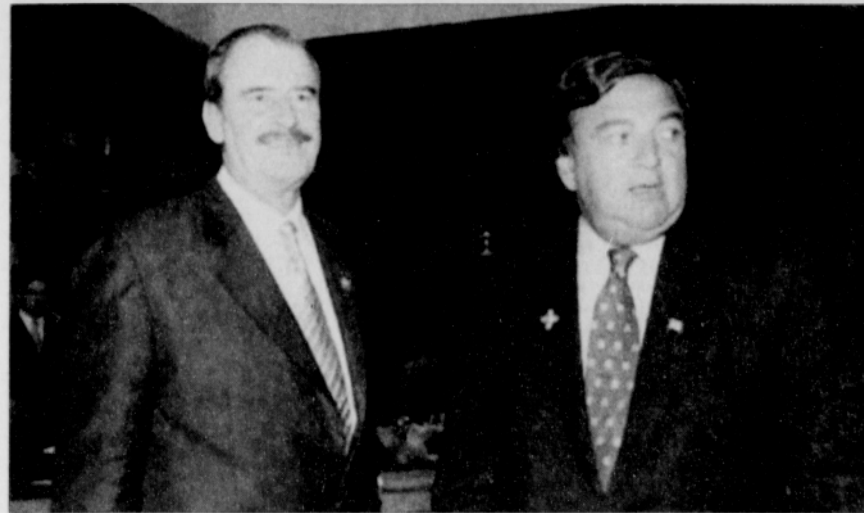
Mexico President Vicente Fox (left) and New Mexico Gov. Bill meet in Mexico City.

(AP) - Investigators acting on opposition complaints haven't found evidence of money laundering in President Vicente Fox's election campaign, the Federal Electoral Institute said Monday.