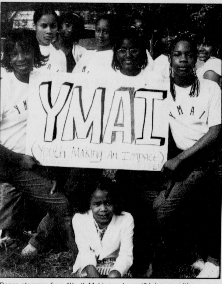
Dance steppers from "Youth Making an Impact" bring a positive contribution to the Portland Juneteenth parade, carnival and other events.