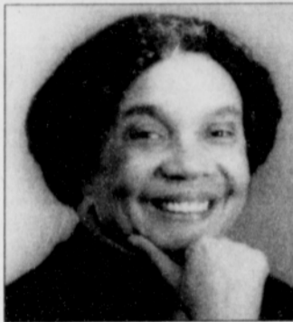
Marian Wright Edelman

Providing massive tax cuts to the rich in 2001 and 2003 while dismantling child investments like Head Start, health care, child care, and education will leave millions of children behind. And the reckless tax cuts enacted by Congress in 2003 and signed by President Bush