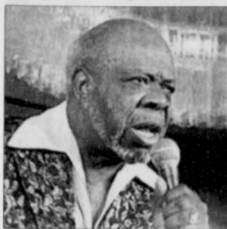
R&B star Rufus Thomas died at age 84 in December 2001, shortly after "Only the Strong Survive" was completed.