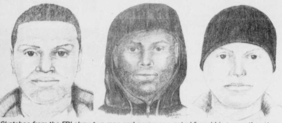
Sketches from the FBI show two men and a woman wanted for robbing a southeast Portland bank.

The Oregon FBI is offering up to $5,000 30's, with average height and weight. One of the reward for information leading to the arrest of those responsible for the April 9 robbery at the Bank of the West, 8135 S.E. Division.