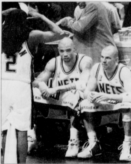
New Jersey Nets' Kenyon Martin (center) and Jason Kidd (right) sit on the bench during Game 3 of the NBA Finals.

So far, the Nets seem stuck on the same step they took last season: good enough to beat everyone in the East, but struggling against the West powers.