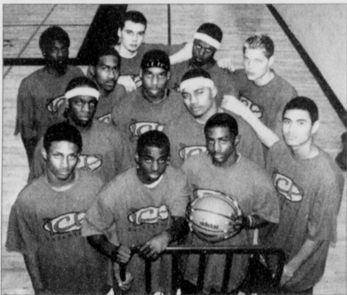
The Inner City Players use basketball as a motivational vehicle to prepare them for the ultimate game: life.

Top players from around the country slated for weekend play