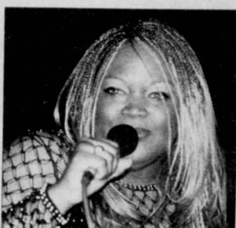
AWARDS (clockwise from left): B.B. King - Entertainer of the Year; Pinetop Perkins - Inducted into The Blues Hall of Fame; Koko Taylor - Traditional Female Artist; Shemekia Copeland - Blues Album of the Year, Contemporary Female Artist, Contemporary Blues Album; Magic Slim and the Teardrops - Blues Band of the Year; Robert Randolph - Best New Artist.