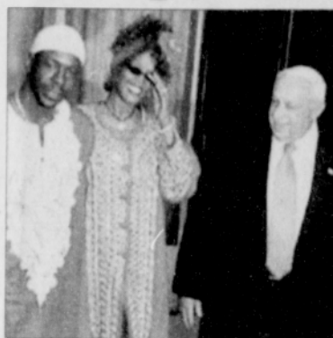
While in Israel Whitney Houston stayed with a group of Black Hebrews and met Israeli Prime Minister Ariel Sharon.

(AP) — Singer Whitney Houston is in Israel looking for inspiration for her upcoming Christmas album. Houston arrived last Sunday for her stay with the Black Hebrews, a group of nearly 2,000 black Americans who followed a Chicago bus driver to Israel decades ago and believe they are descendants of one of the lost tribes of Israelites.