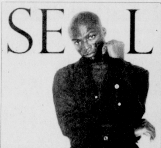
Seal's third self-titled album, due Sept. 9 was four years in the making, three of which were spent recording and ultimately scrapping a completed initial version. That collection didn't earn Seal's approval because "it lacked consistency."

He served nearly five years in prison on assault and other charges before being released in 2001, then was sent to jail last year for allegedly violating the terms of his parole by associating with gang members. He was released in February and ordered to perform 200 hours of community service aimed at persuading children to avoid gangs.