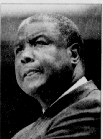
Coach Paul Silas hired at Cleveland.