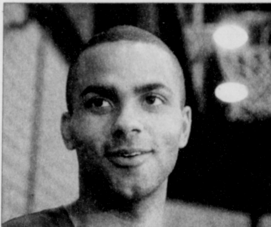
San Antonio Spurs guard Tony Parker (above), one of the NBA's youngest players, will match-up against New Jersey Nets veteran Jason Kidd (right) in the NBA finals starting Wednesday in San Antonio

His matchup against Nets point guard Jason Kidd will be one of the keys, and it comes with an intriguing subplot. The Spurs will have more than $14 million worth of salary cap space over the summer when Kidd becomes a free agent, and it's possible they could make him an offer.