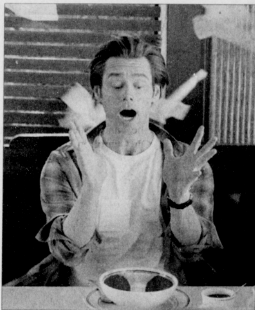
The Jim Carrey comedy "Bruce Almighty" features a telephone number to call God. Rather than use the normal 555 movie prefix, the movie uses a number with more than 30 listings nationwide. Some people with God's number are not pleased.

— Tracy Collington, the wife of an evangelist who happens to share the same telephone number as the one used to call God on 'Bruce Almighty'