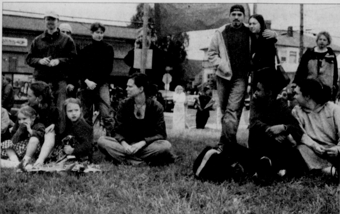
Alberta Art Hop crowds enjoy a band playing in an empty lot on Northeast 20 th and Alberta. The rain stayed away long enough on Saturday to allow for musicians and artists to give hands-on demonstrations to those who came out for the street fest.