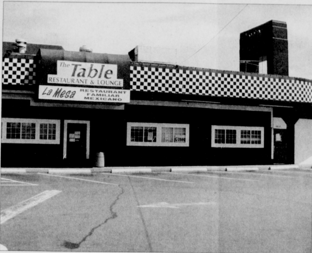
The Table Restaurant and Lounge at 6815 N.E. Killingsworth stands closed Tuesday after being shut down for complaints of cocaine and methamphetamine sales.

According to the OLCC suspension notice, the licensee permitted repeated illegal drug activity at the site. The OLCC also alleged that on