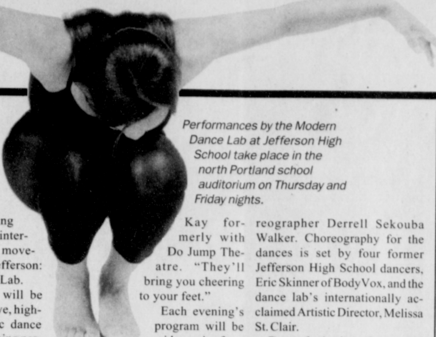
Performances by the Modern Dance Lab at Jefferson High School take place in the north Portland school auditorium on Thursday and Friday nights.