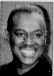
Luther Vandross is struggling to survive after an April 16 stroke. The Grammy-winning singer

remains in intensive care and has not regained consciousness.