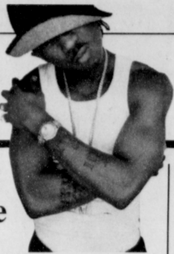
Recording artist Ja Rule.

Ja Rule, whose real name is Jeffrey Atkins, started his career with TVT in 1993 and moved to Island