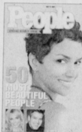
Halle Berry graces last week's cover of People.

Halle Berry, the first African American woman to win an Oscar for her performance in "Monster's Ball," made People Magazine's annual list of the "50 Most Beautiful People in the World" for the seventh time this year.