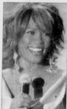
Whitney Houston on the set of "Boston Public." The singer will perform her latest single, "Try It on My Own," during the season finale.

Students and faculty will host the annual Oregon College of Art and Craft sale with 30 percent of proceeds given for guest artists and 70 percent given to participating artists. The sale takes place at the college, located at 8245 S.W. Barnes Rd. The sale will be free and open to the public from 10 a.m. to 4 p.m. on Saturday, May 17 and Sunday, May 18.