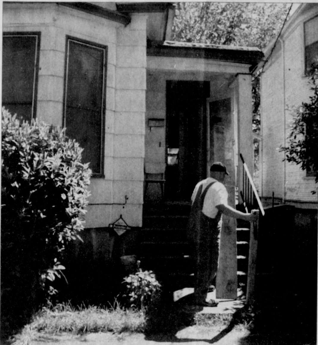
Lumber is brought in to make repairs to the entrance of a home on Northeast Tillamook after two men kicked in the door of the residence and shot a teenager. The victim survived a wound to the top of a shoulder, near the base of his neck.

Investigators said it's possible the shooting was gang-related or may have involved drugs.