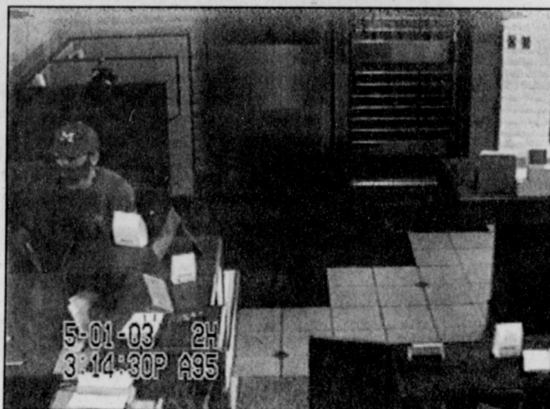
A photograph shows a suspect in the robbery of the Sterling Savings Bank at 3333 N. Lombard on Thursday. The FBI said the man might have been hurt when an anti-theft device exploded as he ran from the bank.

"We've always been opposed to changing the sentence after it is imposed," he said.