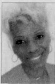
BY ETHEL J. BATES FOR THE PORTLAND OBSERVER

What motivates you to serve God? Do you serve God out of fear, love or gratitude? Are you a manipulative server?