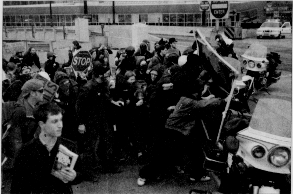
A photo shows a violent confrontation with police during a March 20 war protest downtown. Police hope the photograph can help track down a suspect wanted for using a bat to strike an officer in the head. The suspect is located just left and below the "stop" sign.

Crime Stoppers is offering a cash reward of up to $1,000 for information, reported to Crime Stoppers, that leads to an arrest in this case, or any unsolved felony crime, any you need not give your name. Call Crime Stoppers at 503-823-HELP.