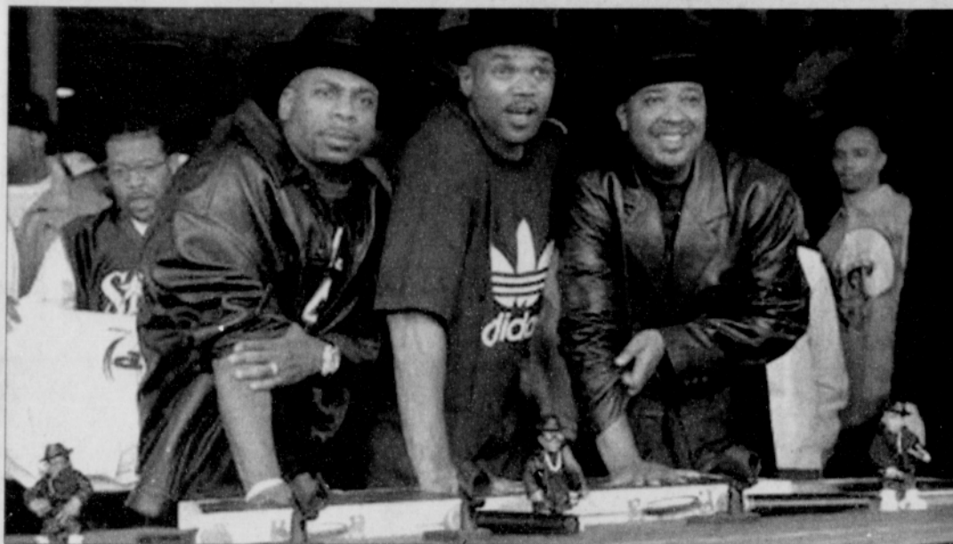
Hip-hop pioneers RUN-DMC create handprints in cement as they are inducted into Hollywood's RockWalk on Feb. 25, 2002, in Los Angeles. Jason "Jam Master Jay" Mizell, left, Darryl "DMC" McDaniels, center, and Joseph "DJ Run" Simmons produced the first rap album to go gold as well as the first rap act nominated for a Grammy.