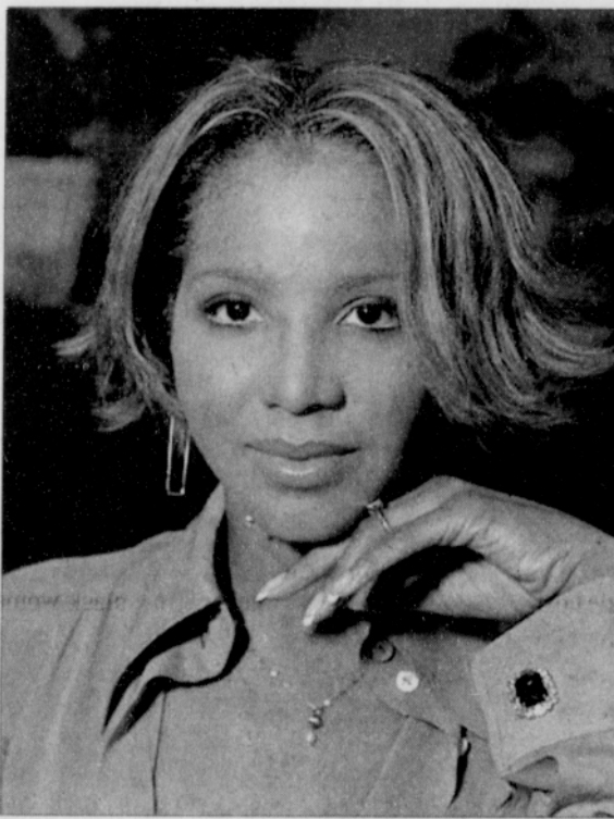
Singer Toni Braxton will take a role in the Disney-produced musical "Aida," which tells the ancient Egyptian story of a Nubian princess in love with a handsome soldier.

"Aida," which has a score by Elton John and Tim Rice, opened at Broadway's Palace Theatre in March 2000. Set in ancient Egypt, it tells the love story of the Nubian princess Aida, sold into slavery, and her love for a handsome soldier, Radames.