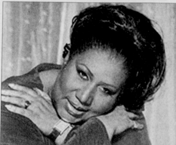
Aretha Franklin will soon conclude her life as a touring artist.

"I'll always be singing. I just won't do as much as I have been. I'm scaling it down."