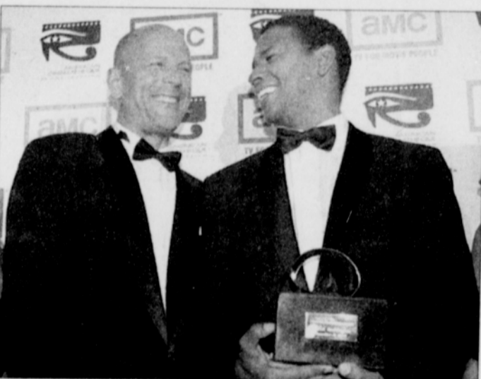
Actors Denzel Washington (right) and Bruce Willis filed a lawsuit along with Arnold Schwarzenegger against Fry's Electronics for allegedly using their images in newspaper advertisements without permission. Each actor seeks $10 million in damages.

Similar lawsuits involving unauthorized uses of celebrities in advertising were filed recently against cosmetics chain Sephora USA by Matthew Broderick, Sarah Jessica Parker, Nicole Kidman and Tom Cruise.