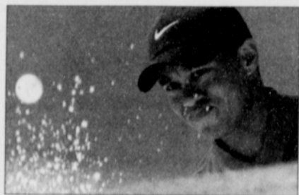
Tiger Woods eyes his ball as he blasts out of the trap on the seventh hole during final round play of the 2003 Masters.

He was smiling and philosophical. But even through the words it was hard to hide the disappointment.