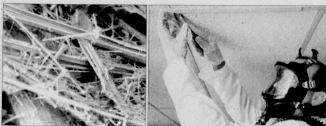
There is no safe level of exposure, so contact with any amount of asbestos can be harmful.