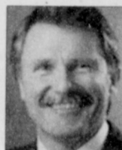
John Kitzhaber, former Oregon governor.

Dr. John Kitzhaber, former governor of Oregon, author of the Oregon Health Plan and emergency room physician, led a recent discussion with the health care professionals of today and tomorrow about the evolution of health care