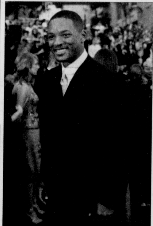
Will Smith decided not to make his fourth appearance as an Oscar presenter.