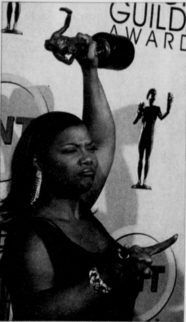
Actress Queen Latifah celebrates her win as part of the ensemble cast of "Chicago" at the Screen Actors Guild awards in Los Angeles on March 9.