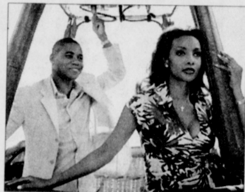
Cuba Gooding Jr. stars in "Boat Trip," along with Vivica A. Fox.

Hoping to get past Gabriella's stalwart defenses, Jerry pretends