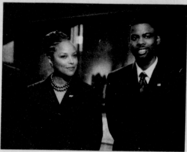
Chris Rock stars as Mays Gilliam, a Washington D.C. politician who is plucked from obscurity and thrust into the limelight as his party's nominee for the President of the United States. Lynn Whitfield (left) plays Deborah Lassiter, Gilliam's campaign adviser, whose job it is to help him lose gracefully without embarrassing the party.