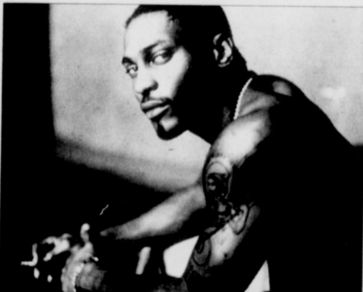
R&B singer D'Angelo has reached a settlement with a woman who said he cursed at her and spit on her in a Nov. 18 traffic confrontation. D'Angelo, 29, won Grammys in 2000 for best R&B album for "Voodoo" and for best male R&B vocal performance for "Untitled (How Does It Feel)."

(AP)—Grammy-winning R&B singer D'Angelo has reached a civil settlement with a woman who said he spit on her.