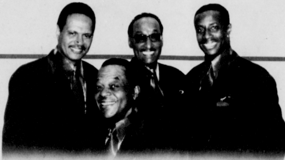
The smooth vocal blending of the Four Tops will bring the DooWop days of the 50s to life when the legendary entertainers perform at Chinook Winds Casino in Lincoln City for 8 p.m. shows on Friday and Saturday, March 21 and 22. The Four Tops have been marveling audiences with their infectious blend of pure vocal power and sweet harmonies since 1954. For tickets, call 1-888-624-6228 or 1-800-992-8499.