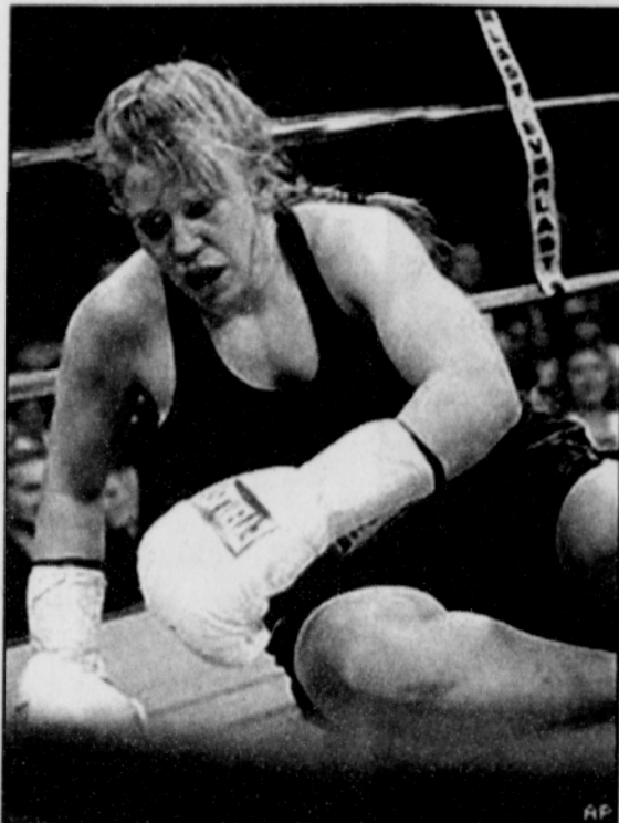
Tonya Harding lands on the mat in her pro boxing debut.