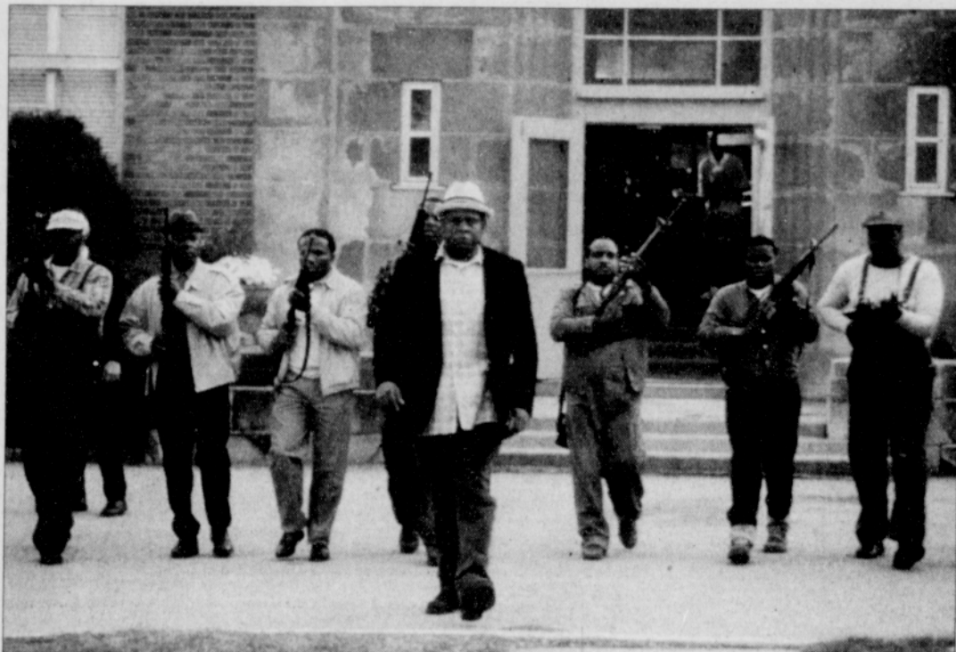
"Deacons For Defense" is based on the true story of an African American militia group that wanted to fight the Ku Klux Klan. The film stars Forest Whitaker, Jonathan Silverman and Ossie Davis star.