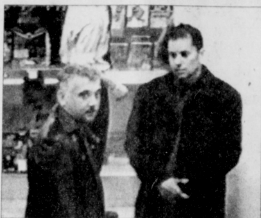
Police try to identify men