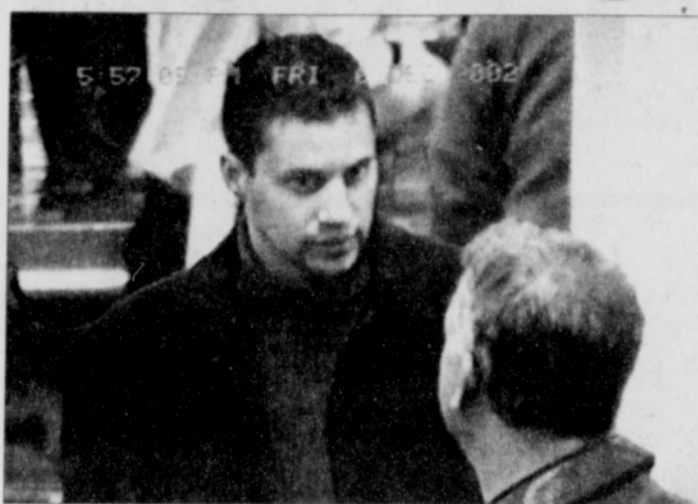
Vancouver police released these store surveillance pictures to show the suspects in an identity theft and forgery case.

On Dec. 6 at approximately 5:50 p.m. two white male suspects entered Sears at Westfield Shopping Center in Vancouver and attempted to commit identity theft and forgery. They were caught