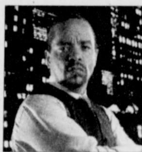
Law & Order actor Ice-T