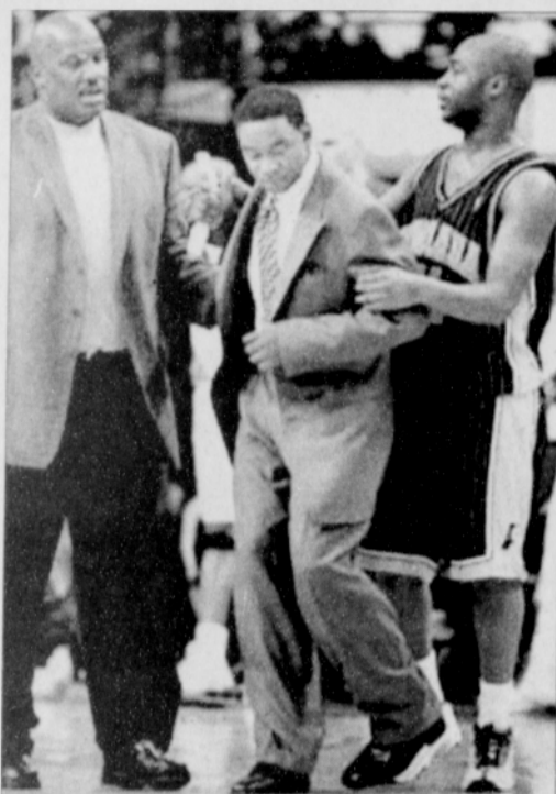
Indiana Pacers Coach Isiah Thomas gets into a shouting match with game officials.