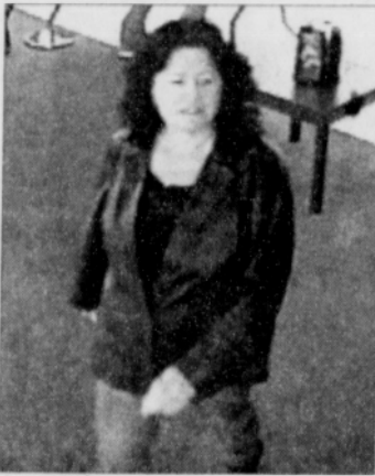
Police released this store surveillance photo of a woman wanted in an auto accident scam.

In both cases, police said the victims were later given estimates of damages and then paid the fraudulent claims.