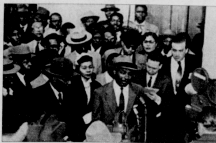
The Rev. Martin Luther King Jr. speaks to the media on May 20, 1956, about his arrest for leading the Montgomery bus boycott.

"At The King Center, we encourage people to serve their communities and nation by serving one another and making service a way of life—not just on the King holiday, but every day," Mrs. King added.