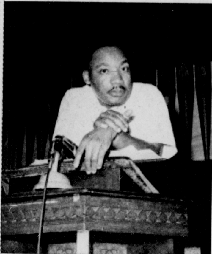
Dr. Martin Luther King Jr.'s legacy is advanced at Atlanta's King Center, which was opened in 1968 by Coretta Scott King and is now run by the National Park Service.

Denny's restaurants plan to raise $1 million this year for The King Center in Atlanta, a national treasure advancing the ideals of the civil rights leader.