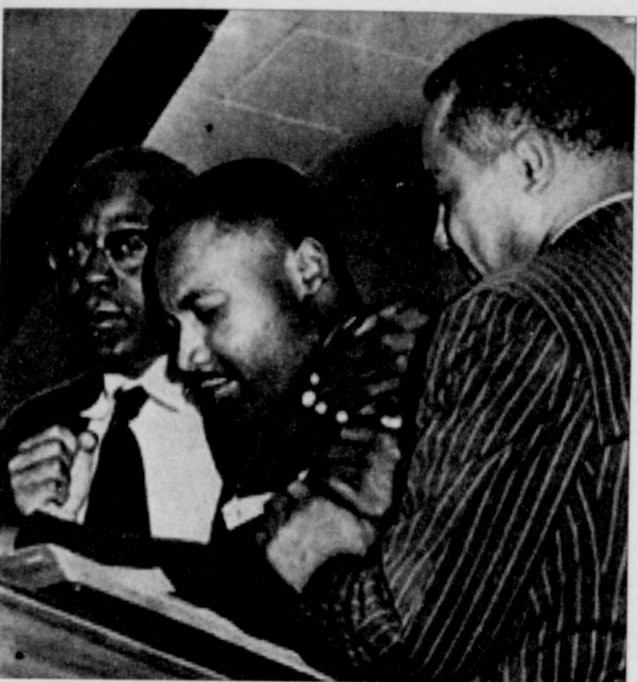
The Rev. Martin Luther King Jr. collapses after praying in Montgomery over bus-integration violence. Jan. 15, 1957.

Eat at "SMALL WORLD CAFE" Inside of BIG CITY PRODUCE Open 7 days a week!!!