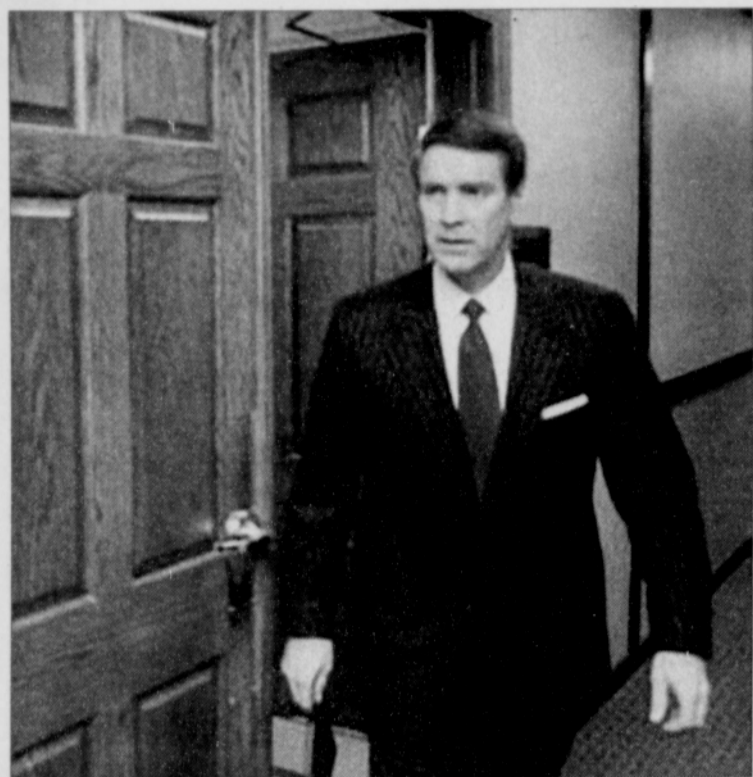
Sen. Bill Frist, R-Tenn. leaves his office in Nashville, Tenn after being elected U.S. Senate majority leader Monday. Frist will replace Trent Lott, R-Miss. who resigned last week after making remarks many saw as racist.